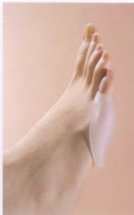
HFOS530-000 Silicone Last Toe Shield Size: S/M(3), L/XL(7) Color: Transparent(Z) Packing: 1 piece/Box 320 Boxes/Carton