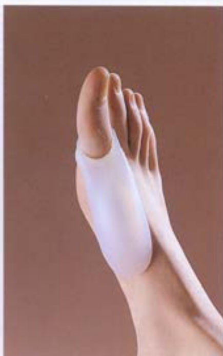
HFOS540-000 Silicone Bunion Shield Size: S/M(3), L/XL(7) Color: Transparent(Z) Packing: 1 piece/Box 320 Boxes/Carton