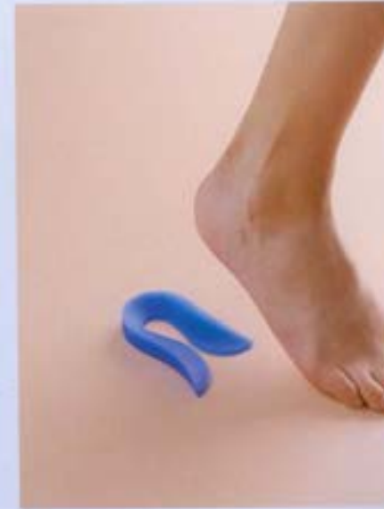
HFOS140-000 Silicone Heel Cushion, U-Shaped Size: S(3), M(5), L(7) Color: Blue(U) Packing: 1 pair/Box 160 Boxes/Carton