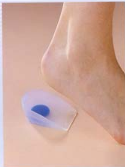
HFOS100-000 Silicone Heel Cup, Spurred (Central Dot) Size: S(3), M(5), L(7), XL(8) Color: Transparent(Z) Packing: 1 pair/Box 80 Boxes/Carton