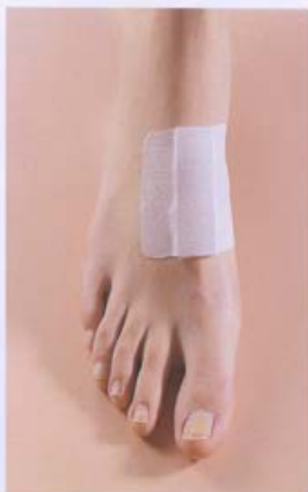
HFOS610-000 Silicone Strip plaster Size: One Size Fits All (0) Color: White(W) Flesh(T) Packing: 4 pieces/pack/Box 640 Boxes/Carton