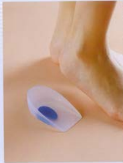
HFOS101-000 Silicone Heel Cup, Posted (Lateral Dot) Size: S(3), M(5), L(7), XL(8) Color: Transparent(Z) Packing: 1 pair/Box 80 Boxes/Carton