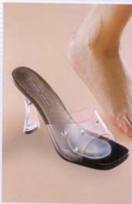
HFOS400-000 Silicone Metatarsal Pad For High Heel Shoes Size: S/M(3), L/XL(7) Color: Transparent (Z) Packing: 1 pair/Box 320 Boxes/Carton