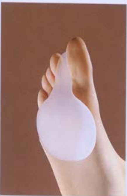
HFOS500-000 Silicone Metatarsal Cushion, Clip-on style, Right and Left Size: S/M(3), L/XL(7) Color: Transparent (Z) Packing: 1 pair/Box 320 Boxes/Carton