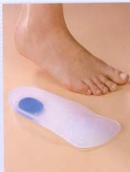
HFOS200-000 Silicone 3/4 Length Insole Size: S(3), M(5), L(7) Color: Transparent(Z) Packing: 1 pair/Box 60 Boxes/Carton