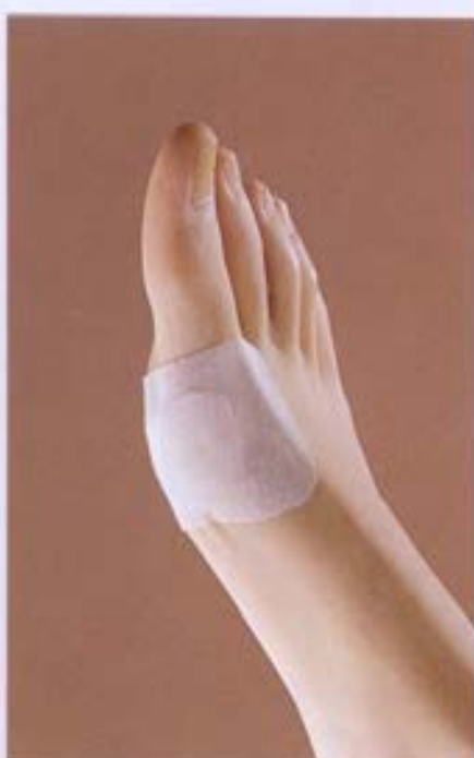
HFOS600-000 Silicone Ring plaster Size: One Size Fits All (0) Color: White(W) Flesh(T) Packing: 4 pieces/pack/Box 640 Boxes/Carton