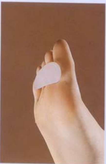
HFOS520-000 Silicone Hammer Toe Crest, Right and Left Size: S(3), M(5), L(7) Color: Transparent (Z) Packing: 1 pair/Box 320 Boxes/Carton