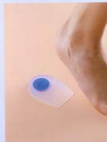
HFOS120-000 Silicone Heel Cushion, Spurred (Central Dot) Size: S(3), M(5), L(7) Color: Transparent(Z) Packing: 1 pair/Box 320 Boxes/Carton