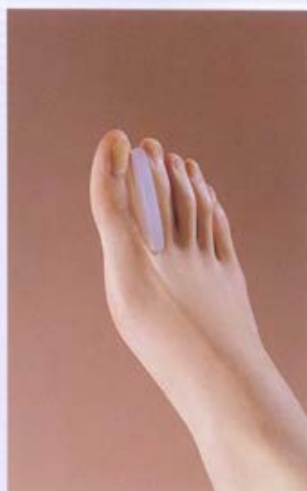
HFOS710-000 Silicone Toe Separators Size: S(3), M(5), L(7) Color: Transparent(Z) Packing: 1 pair/Box 640 Boxes/Carton