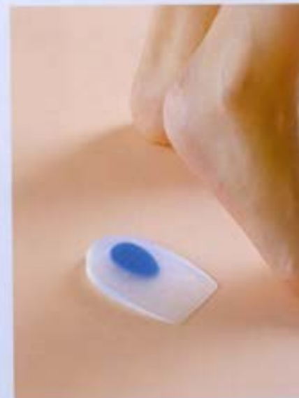
HFOS121-000 Silicone Heel Cushion, Posted (Lateral Dot) Size: S(3), M(5), L(7) Color: Transparent(Z) Packing: 1 pair/Box 320 Boxes/Carton