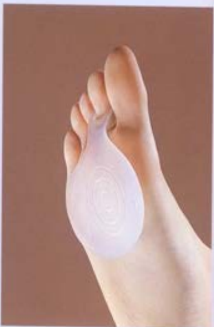
HFOS510-000 Silicone Metatarsal Cushion, Loop-on Style, Right and Left Size: S/M(3), L/XL(7) Color: Transparent (Z) Packing: 1 pair/Box 320 Boxes/Carton